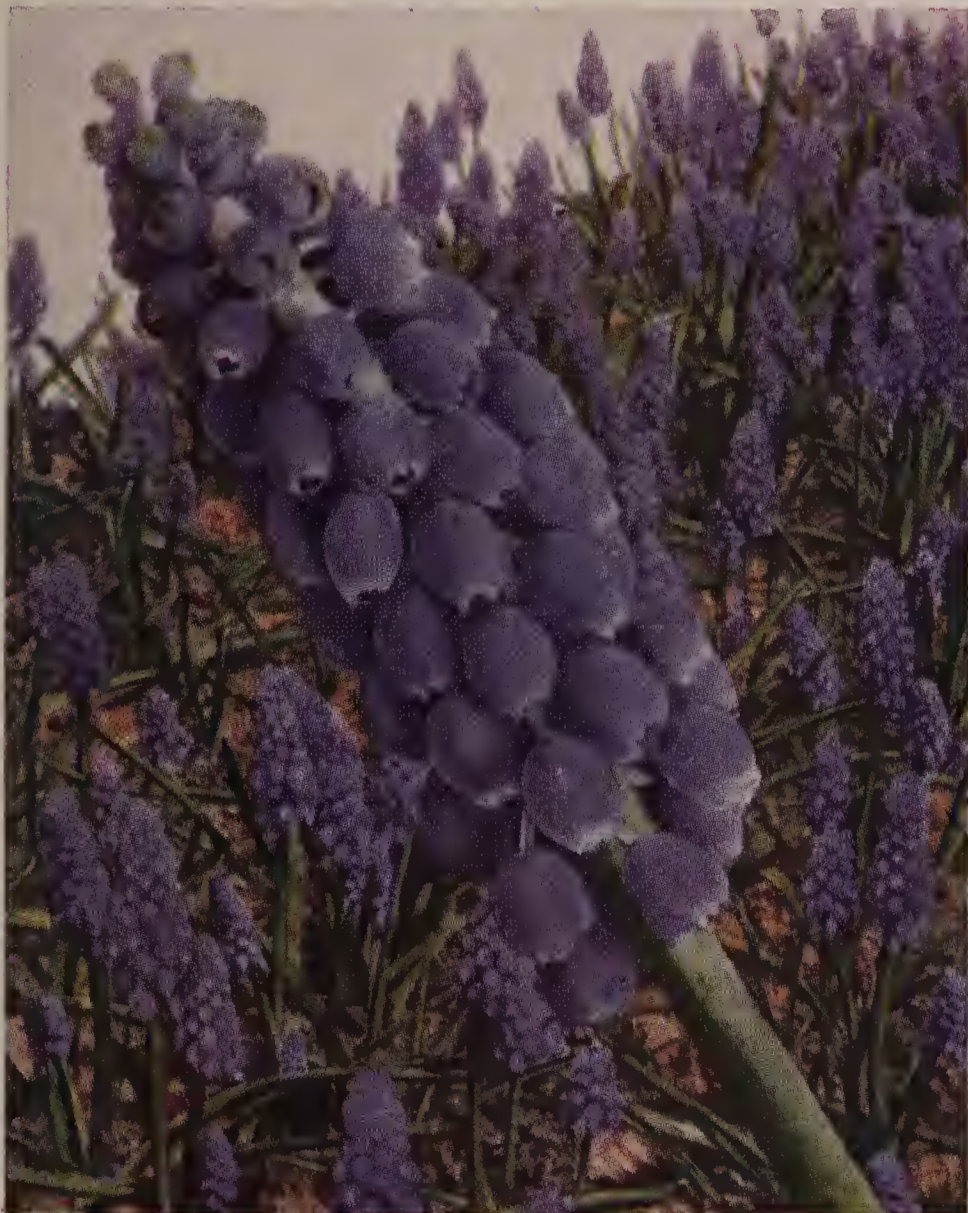
Muscari armeniacum. The finest blue Grape Hyacinth

Now that stocks of this variety have increased, we recommend it as the finest and clearest blue of all the Muscari or Blue Grape Hyacinths. It is especially valuable for naturalizing with narcissi and is excellent for greenhouse forcing during the winter. The spikes attain the height of 4 to 5 inches and are well set with beautiful clear blue flowers. 35 cts. for 10; $3.00 per 100; $25.00 per 1000.